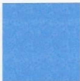
Fabric 7 Medium 1-1/8 yards (Not used in lap)