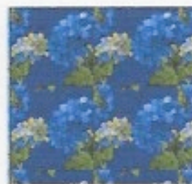
Fabric 6 Main print 2-1/4 yards (1 yard)