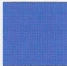
Fabric 3 Dark 1-5/8 yards (7/8 yard)