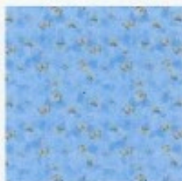
Fabric 5 Light 2-1/4 yards (1 yard)