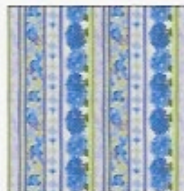
Fabric 8 Small border stripe 1-1/4 yards (1-1/4 yards)

Bed backing: 7-3/4 yards (3 pieces) Batting: 91" x 110" Lap backing: 4 yards (2 pieces) Batting: 70" x 70"