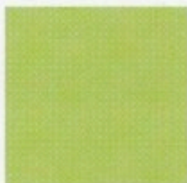
Fabric 2 Contrast 1-3/4 yards (5/8 yard)